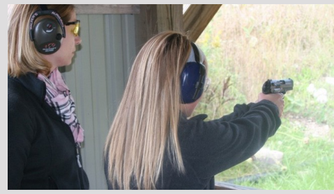
WE SUPPLY EVERYTHING. DO NOT BRING ANY FIREARMS OR EQUIPMENT!